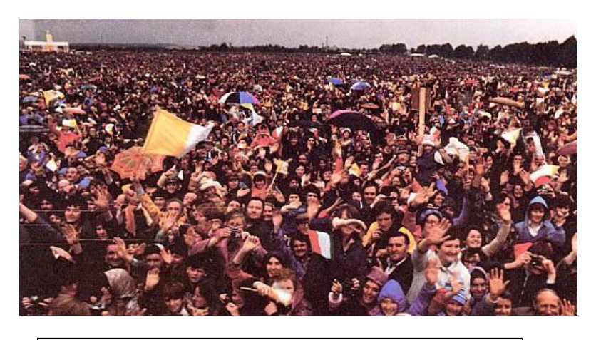
A section of the gathering in Limerick on October 1<sup>st</sup> 1979

The first visit of a Pope to Ireland would have been an extraordinary occasion in any case. But, in spite of all the preparations and the weeks of anticipation, nobody realised how overwhelming the event would prove to be. The Pope's evident conviction, his warm, energetic presence and the strength of his desire to communicate with us had an impact beyond anything we had expected.