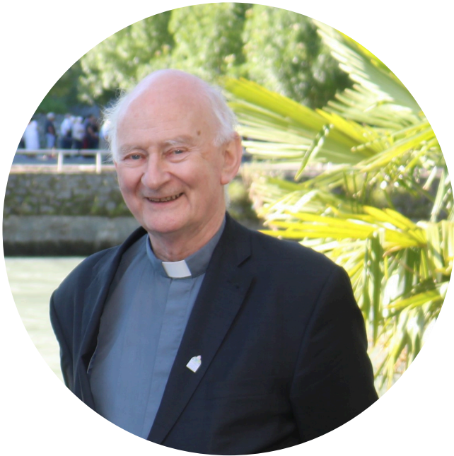
Bishop Emeritus Donal Murray died on 13th October 2024