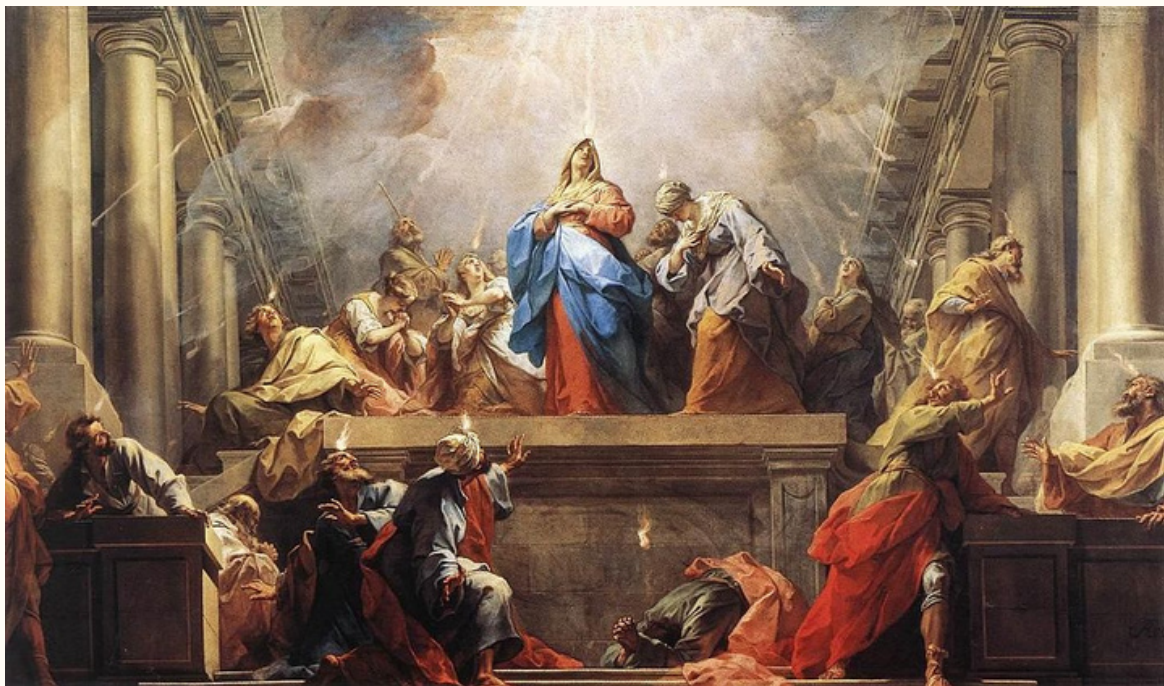
"Pentecost" by Jean Restout, 1732, public domain