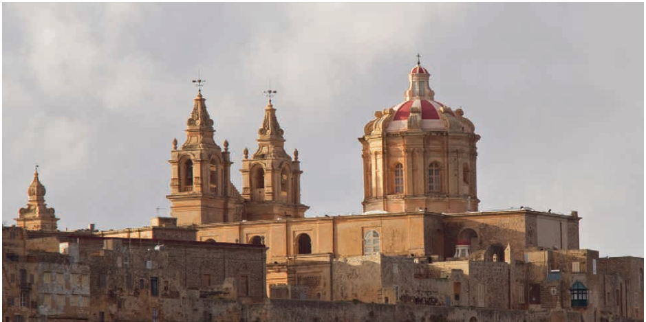
St. Paul's Cathedral, Mdina, Malta

The story of St Paul's being shipwrecked on Malta in Acts 27 and 28 leads us, during this Week of Prayer for Christian Unity, to reflect upon many aspects of our own lives and the lives of our churches. As we approach one another, seeking unity, we recognize that we sometimes carry baggage from history, tradition and cultural expectation, which can weigh us down and threaten to overwhelm us. There is the danger that, in the face of that experience, we might