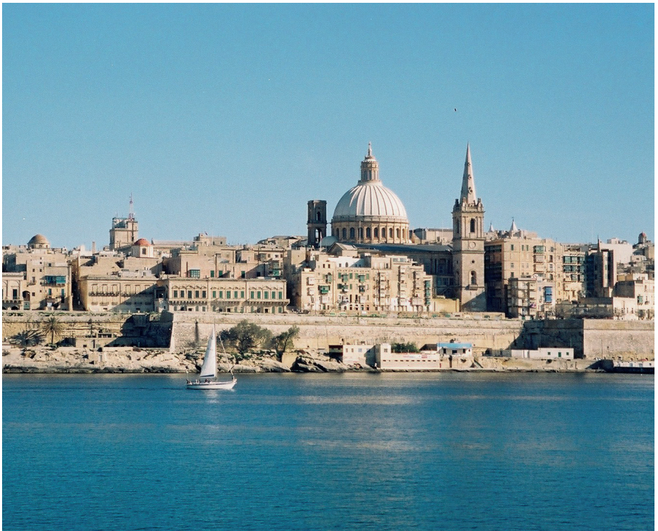
St. Paul's Pro Cathedral, Valletta, Malta

For this year's Week of Prayer for Christian Unity, we accompany the churches of Malta, praying with and alongside them, praying also for them in their Christian journey as they seek the unity for which Christ prayed. And we rejoice with them that Malta traces its Christian origins back to the time of the Apostles. And in so doing, we enter into the drama of St Paul, those that travelled with him, and the inhabitants whom they met, to discover our shared unity, and in so doing recognise the importance of unusual acts of kindness that bear witness to the Gospel of peace and reconciliation.