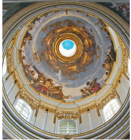
St. Paul's Cathedral, Mdina, Malta

Almighty God, our personal suffering leads us to cry out in pain and we shrink in fear when we experience sickness, anxiety or the death of loved ones. Teach us to trust You. May the churches we belong to be signs of Your providential care. Make us true disciples of Your Son who taught us to listen to Your word and to serve one another. In confidence we ask this in the name of Your Son, and in the power of the Holy Spirit. Amen.